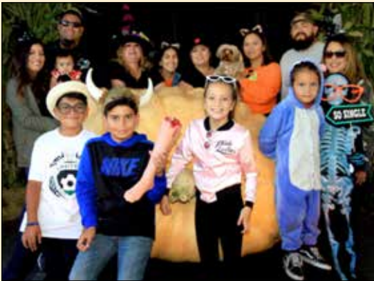
Pumpkin Festival Photo Booth 2019

CEF relies on the community's generosity to reach our fundraising goals.