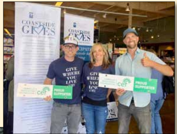
Coastside Gives 2019

CEF relies on the community's generosity to reach our fundraising goals.