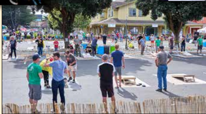
Cornhole Tournament 2019

Every Student Matters, Every Dollar Matters. Your Gift Makes A Difference!